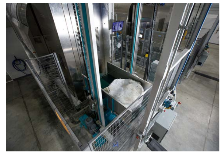
A LAVATEC press removes excess moisture, and the linen "cake" goes to the next available dryer.

"At the original building we had two shuttles and 12 dryers. Over the years of operating this system, we had determined the shuttles were the main source of many faults," he recalled.