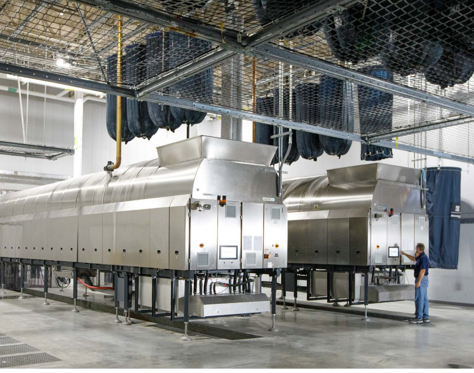
The simplicity, longevity and prior success were several factors that figured into the decision to purchase new tunnel washers and other LAVATEC equipment.

sure sign of Detroit's continued rebirth and revitalization is evident only a couple of miles from downtown. Last year, Metropolitan Detroit Area Hospital Services completed construction of a gleaming new, state-of-the-art laundry facility down the street from Henry Ford Hospital on Elijah McCoy Drive.