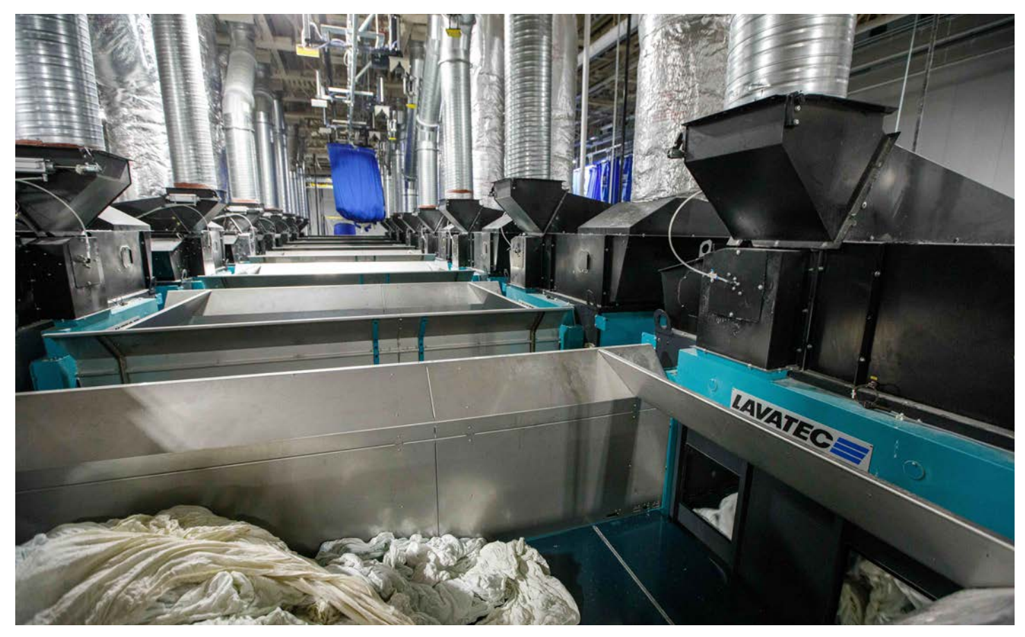
Since installing 16 new LAVATEC gas dryers, MDAHS has experienced a 27% decrease in natural gas consumption per 100 pounds of processed linen – impressive considering they ship in excess of 2.5 million pounds per month.

The new building is more than double the size at 115,000 square feet. Built with other considerations in mind, the sustainable design features a wastewater heat reclamation system that incorporates eco-friendly cleaning products and recycled materials. The drying portion of the business has its own dedicated room to make the two-shift, five days a week operation more efficient. All areas can be expanded to accommodate future growth, says general manager Dave Haas, who helped guide the transformation.