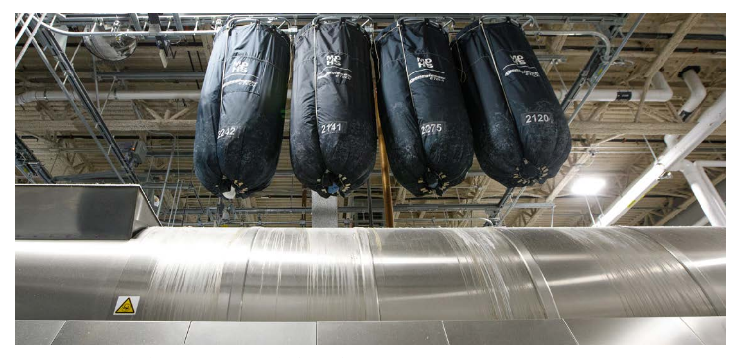
New LAVATEC tunnel washers ready to receive soiled linen in bags.

and mattress underpads that contain water resistant micro denier fabric, to their customers. Haas indicated the 110-pound tunnels raised productivity levels two ways. It gave them adequate rinses and the ability to run more pounds of wash per hour due to the single drum at the load and discharge ends, and a double drum in the middle.