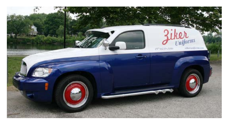
One of three customized HHR (Heritage High Roof) cars is modeled after 1930s era delivery trucks and used to make service calls.

The OnTrak garment tracking system employs Ultra High Frequency (UHF) RFID to keep tabs on every item in each customer's uniform rental program. Ziker is the only regional operator to use UHF.